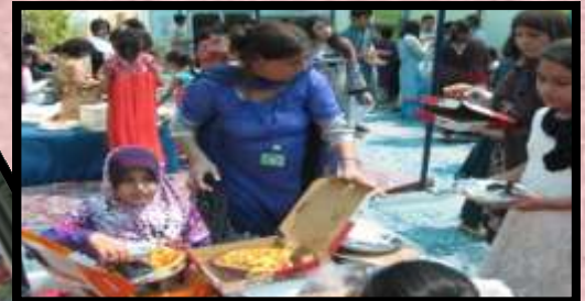
Students enjoying home made goodies