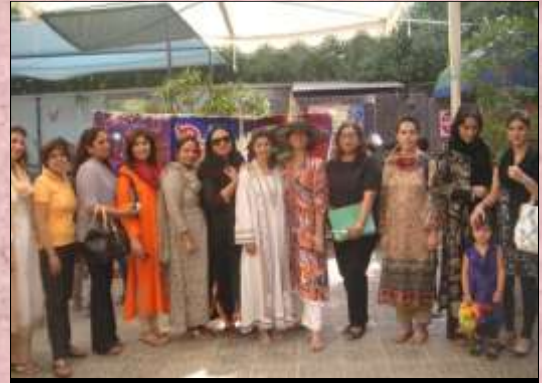
Links Parent Association 2011- 2012