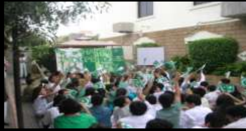
A demonstration of patriotism

Pakistan is our homeland. It is our sanctuary and it is and will be what we make of it. We must protect it, respect it and above all stand by it in all times to come. This year, once again, we were fortunate to have a country to call our own and were given the opportunity to express our gratitude to the leaders of our nation who fought for Pakistan's independence and provided us with a home. Links celebrated Pakistan's 64 th birthday on 14 th of August 2011. The two hour long