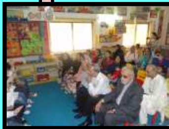
Tiny Tots Performing for their Grandparents

The special kind of love you get from a grandparent is a love you can't get anywhere else. Parents have to worry about who children will become in the future; their role is to be providers and disciplinarians. Grandparents can just enjoy children for who they are in the moment. The love of a