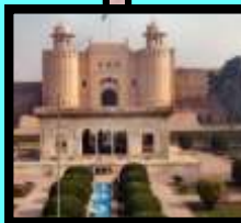
The Famous Lahore Fort

Lahore is a very historical place and tells a lot about our country. Sites such as Shalimar Garden,