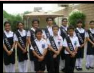
The Links Prefectorial Body 2011-2012

Every year at Links, prefect nominees are chosen by the teachers from classes 3-11. Two children are selected from each section. Prefect nominees are allowed to campaign for about a week to ten days. Campaigning begins in full swing within school hours. Nominees go around the campus distributing badges, stickers, wristbands etc. Moreover, the nominees also deliver speeches justifying why they should be chosen for the job. They also put up posters in different parts of the school to get more votes. The voting process is extremely fair and done in a very professional manner. Once the campaign comes to an end, students from all classes get a chance to vote for their favourite candidates. The results are then tallied by teachers and announced and the elected candidates take an oath of allegiance in the assembly. Prefect campaigning is always fun and the result is full of suspense till the very last minute.