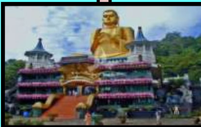
Enchanting Sri Lanka

This year classes 10 and 11 will be going on an exciting trip to Sri Lanka during the winter holidays. This will be a once in a life-time experience for the students since they