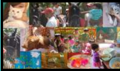
LINKS pre-schoolers enjoying a day with their pets.

Pet Day at Links Pre-School was held on 7 th October. It was an exciting event for the young Links students as they had a chance to bring in and share their furry friends with their friends at school. The children had an opportunity to observe the animals closely as well as play with them. Teachers and parents encouraged the little students to pet the creatures. There were a