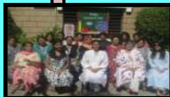
The Faculty members of Links

On the 5 th of October, World Teachers' Day is universally celebrated with great fervour. It is a day when students all over the world get the chance to show appreciation for their teachers. Students of Links realize the importance of a teacher in their lives, and so honour their