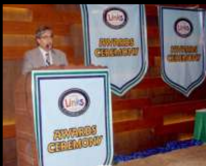
The Education Minister giving a speech at the Links Award Ceremony